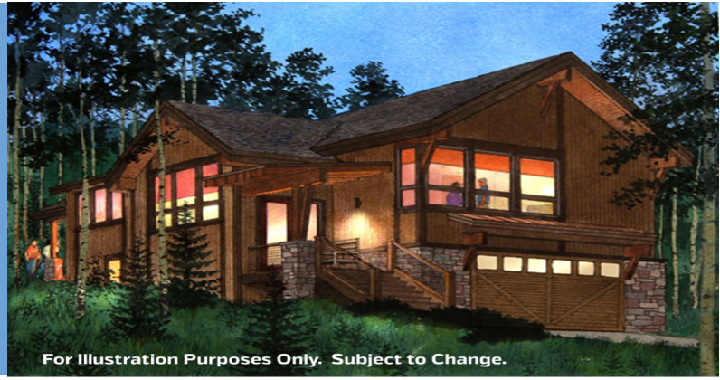
For Illustration Purposes Only. Subject to Change.

2,500 sq ft | 4 Bedrooms | 3.5 Bathrooms