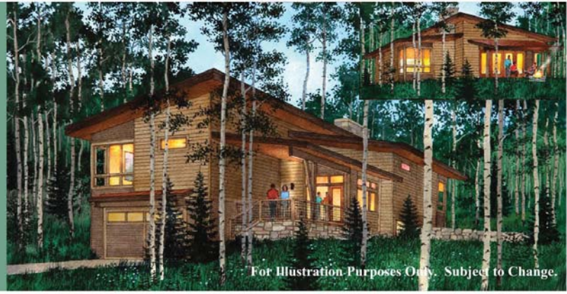
For Illustration Purposes Only. Subject to Change.